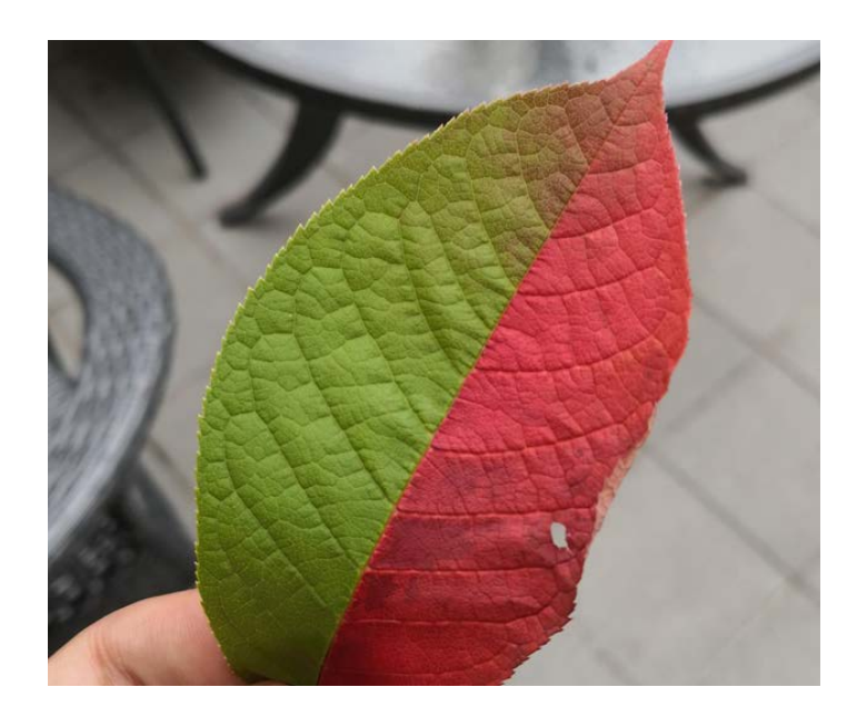
As seen by someone without colorblindness