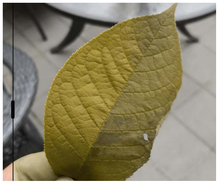
As seen by someone who is colorblind